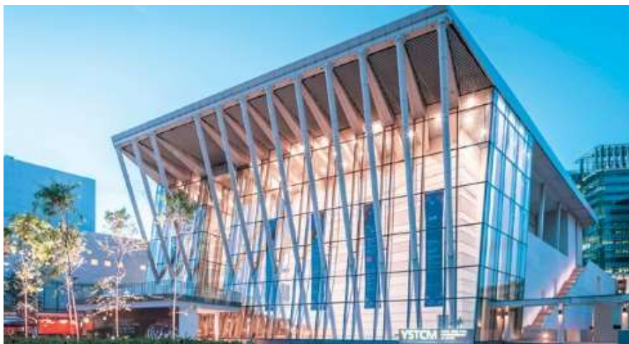
Facade & entrance to YSTCM

Click here for more information about the venue, accommodation suggestions, and how to get around Singapore.