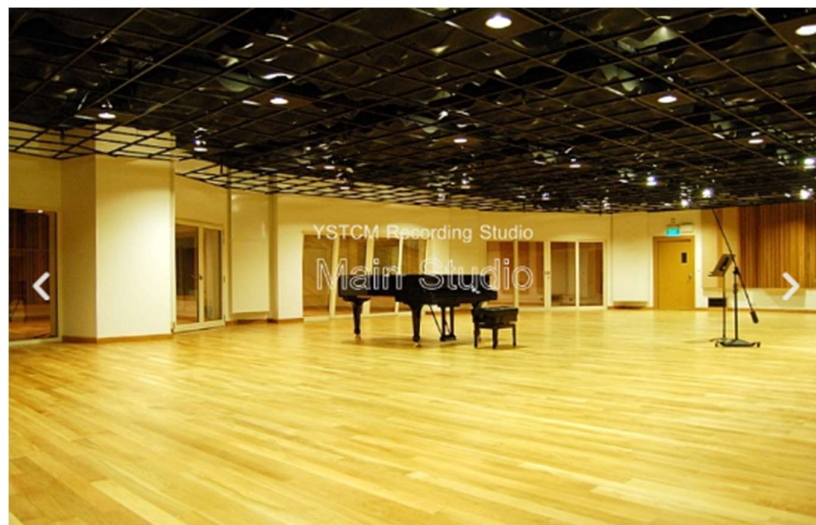
Recording Studio (Level 2)