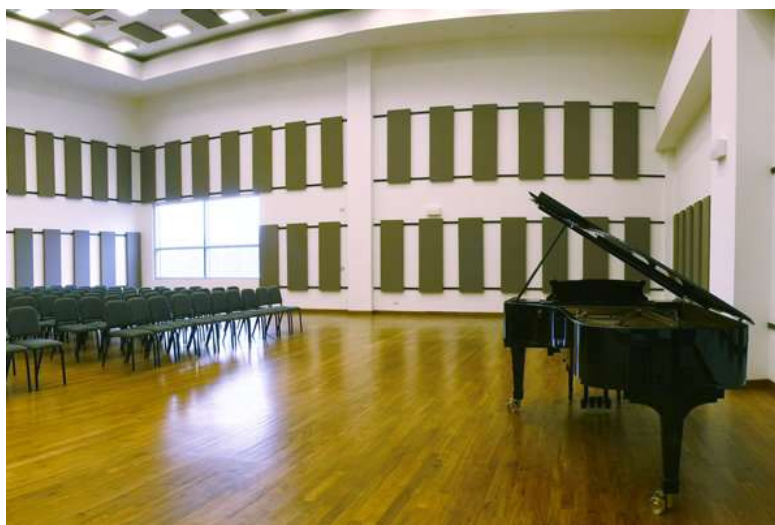
Orchestra Hall (Level 3)