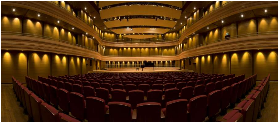
Concert Hall (Level 1) - Gala Concert & Awards Ceremony